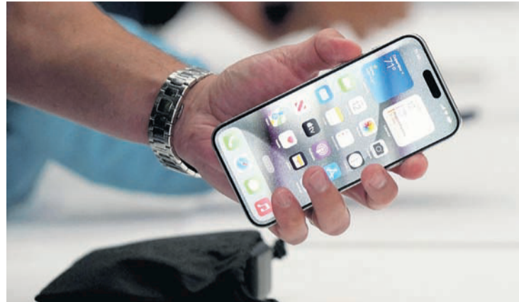
The iPhone 15 Pro is shown after its introduction on the Apple campus, Sept. 12, 2023, in Cupertino, Calif.